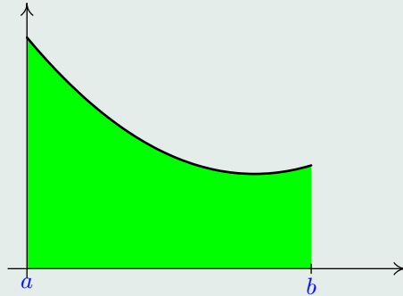
Figure 1: Floating figure